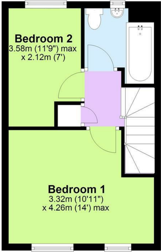
First Floor Approx. 29.5 sq. metres (317.8 sq. feet)

Total area: approx. 58.9 sq. metres (634.0 sq. feet)